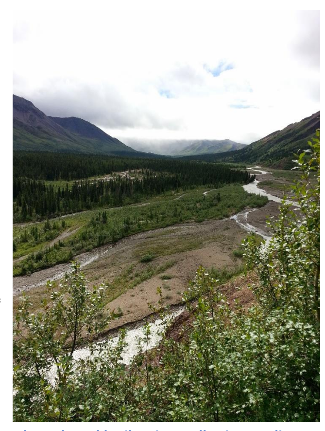
Along the Teklanika River valley in Denali NP.

On July 13, we left Raleigh/Durham airport with our backpacks and flew to Fairbanks, Alaska, with a stop in Minneapolis. Our Delta flight left Minneapolis in the dark. As it continued northwest, the sun reappeared. In Fairbanks at 12:30 a.m., sunlight was abundant. We did not realize two weeks would pass before we would experience dark again. Flying over Canada and Alaska, we saw much water below, and forest fires were common.