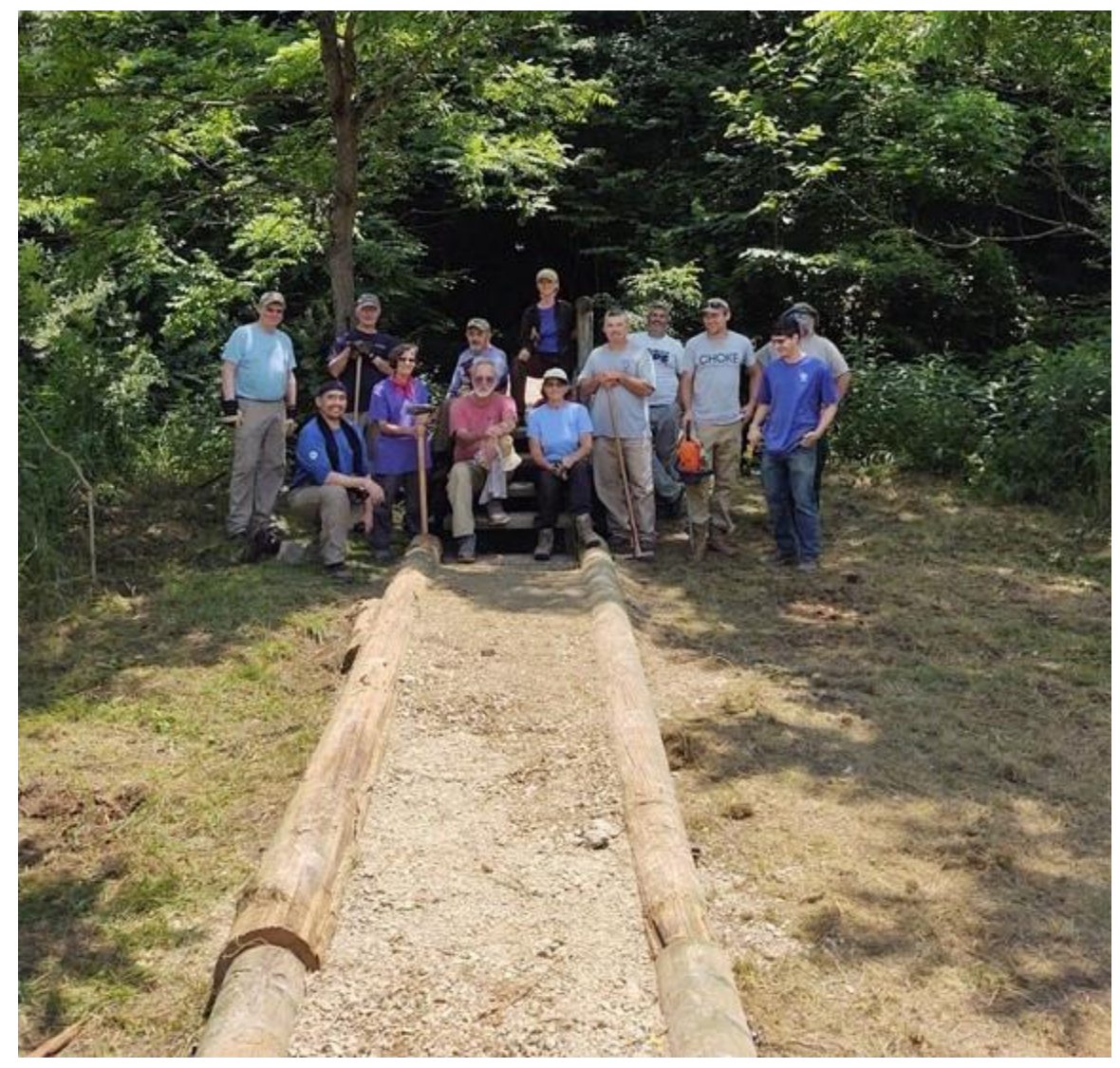
This shows the crew and about one-quarter of the Ory Run turnpike built during July's Summerfest.